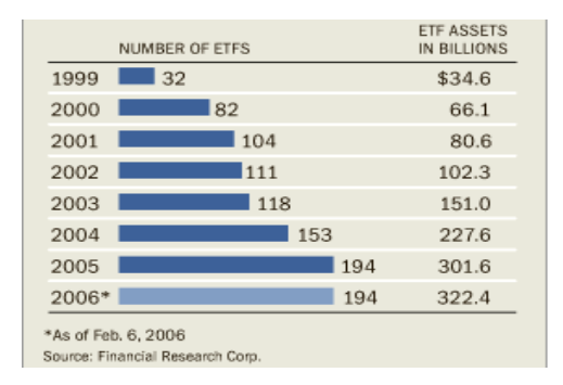
chart below shows just how big the explosion in ETF's has been.

210 Bryant Street, Suite A P.O. Box 7967 Rocky Mount, NC 27804 (252) 451-1450 Toll Free (877) 4-JOLLEY Web Site: www.jolleyasset.com E-Mail: fjolley@jolleyasset.com